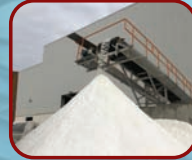
SALT WASHERY 100 TO 200TPH