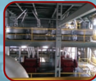
FLEXIBLE SIEVING & SORTING SECTION