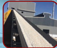
INDUSTRIAL MATERIAL HANDLING SYSTEM

159/160, Udyog Bhavan, Sonawala Lane, Goregaon (East), Mumbai - 400 063.