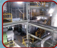
CUSTOMISED PLANT DESIGN