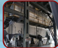
VIBRATORY FBD 5 TO 35 TPH CAPACITY