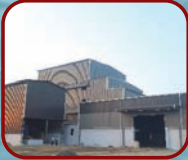
SALT REFINERY PLANT 5 TO 120 TPH

Designers, Manufacturers & Exporters of: Salt Refining Plant, Material Handling System, Fluid Bed Dryers