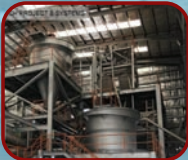
WASHING SYSTEM 5 TO 60 TPH