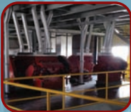
VARIABLE ROLLER CRUSHER